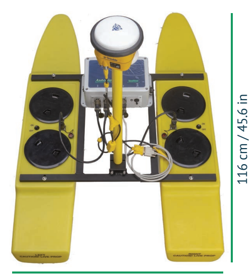
73 cm / 29 in