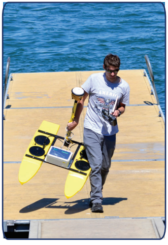
One Person Portable

This highly-economical platform provides the same survey results as more expensive remote-controlled systems.