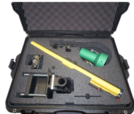
Rugged Shipping Case