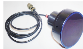
Dual Frequency Echosounder Units