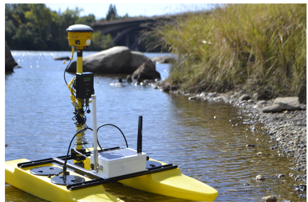
Unit can be integrated into remote / autonomous survey vessels

Seafloor Systems, Incorporated | 4475 Golden Foothill Parkway | El Dorado Hills, CA 95762 | USA